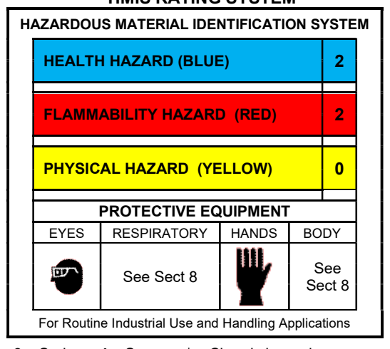
Hazard Scale: 0 = Minimal 1 = Slight 2 = Moderate 3 = Serious 4 = Severe * = Chronic hazard

September 2021 Page 3 of 7 www.pmsilicone.com